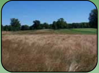
Top and above: Roughs on a golf course in Michigan. Existing turf was completely killed and shown here after reseeding with a blend of Marco Polo sheep fescue and