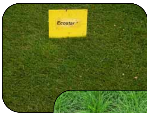
Left: EcoStar cut at 1 in. (2.5 cm) turf height

Seeding Rate: Maintained at turf heights: 4-6 lb/1,000 ft 2 (20-30 g/m 2 ) Unmown areas: 20-40 lb/acre (25-45 kgs/ha) Overseeding into existing turf: 6-10 lb/1,000 ft 2 (30-50 g/m 2 )