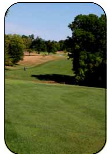
EverGlade in fairway mixture

Seeding Rate: 2-3 lbs./1000 ft 2 (10-15 g/m 2 ) by itself or blended with other bluegrasses. Mix EverGlade with 20% ryegrass or 80% tall fescue.